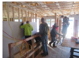
Sheet Rock Installation